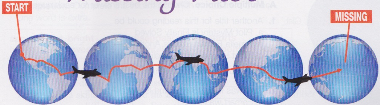
▲ The path of Amelia Earhart's 1937 round-the-world flight