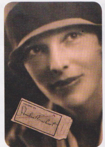
▲ Not only a pilot, Amelia Earhart was also one of the most stylish women of her time.

After about twenty hours, Earhart and Noonan approached Howland Island. The island was only about 105 kilometers (65 miles) away, but the bright sun was shining in their faces so they couldn't see it. Near Howland, a ship, the Itasca , was waiting. Earhart contacted the ship: "Gas is low," she said. The Itasca tried to maintain contact with her but got no response . Finally, the Itasca called for help. People searched for Earhart and Noonan for days. Despite the searchers' efforts , they found nothing.