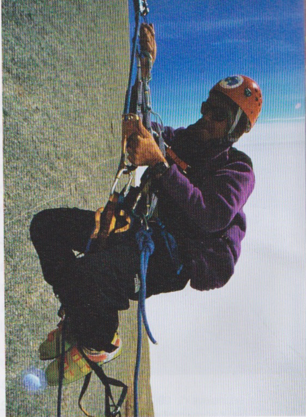
▲ Mountain climber Conrad Anker discovered Mallory's body on May 1, 1999.